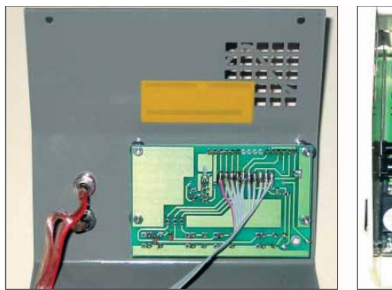
Upper panel with LCD display