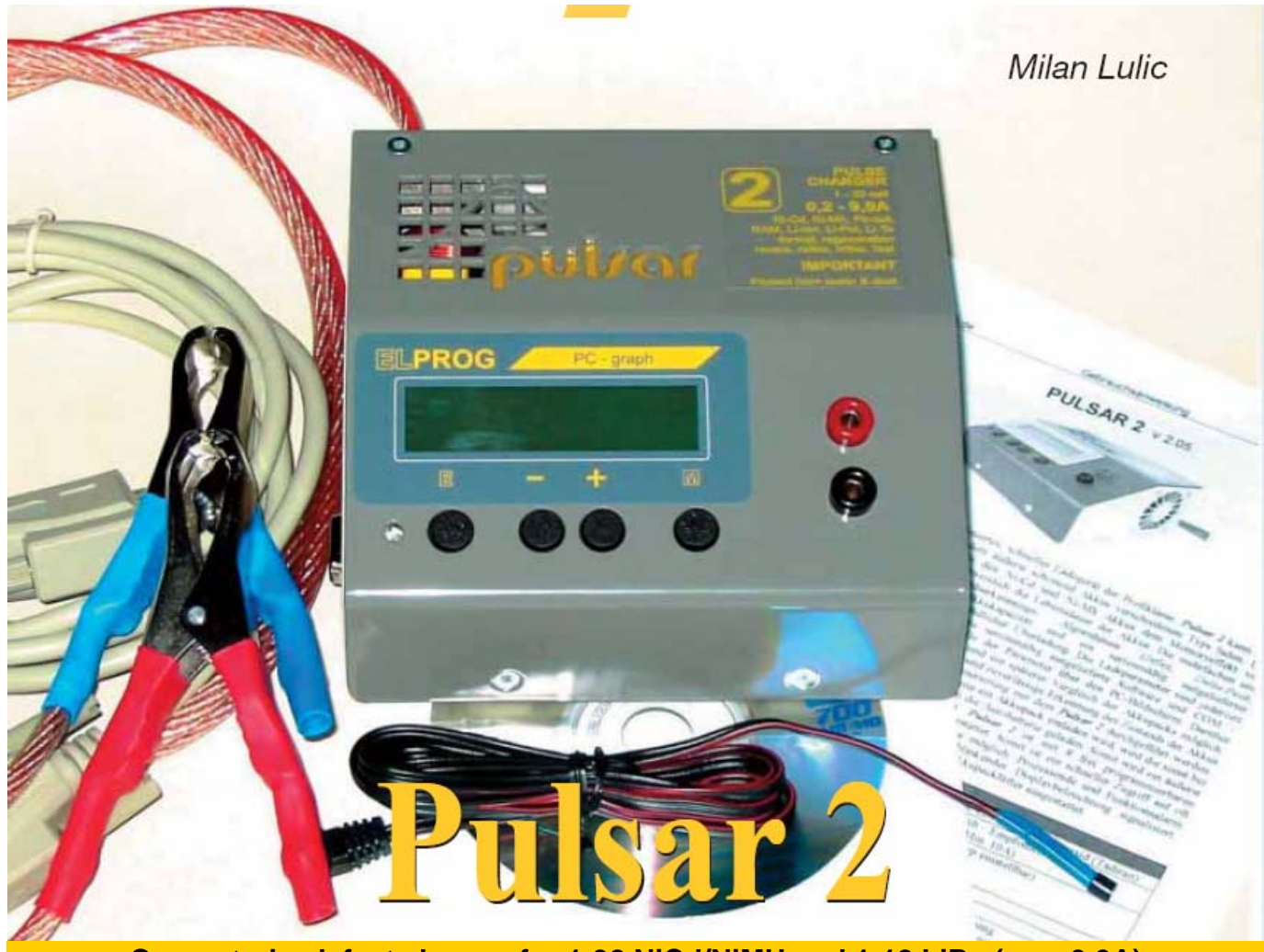
Computerized, fast charger for 1-32 NiCd/NiMH and 1-12 LiPo (max 9.9A)

Someone, surfing the internet (like author does) can take advantage of finding news, just after they become available on the net. This way, near the end of previous year I found a new, computerized, fast charger Pulsar 2 with label "Made In Poland".