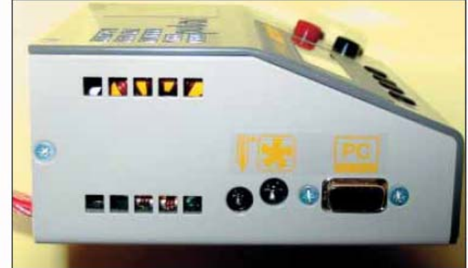
Right side: sockets for temperature sensor, cooling fan and PC Cable