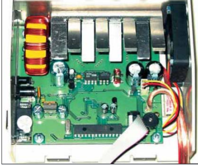
Clean construction: there's cooling fan on the right behind radiator